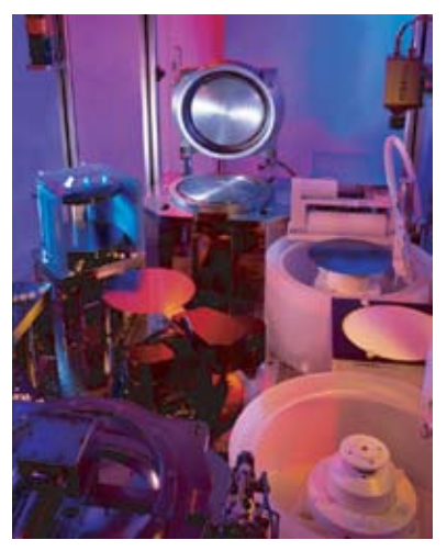
The SiGen Plasma Activation Chamber (open, in background) is shown here incorporated into an EV850 cluster tool.

electrode with the bottom electrode as the "bias" electrode. Each electrode is connected to an RF generator via an RF match. The top lid swings open on a hinge assembly to allow for wafer introduction into and retrieval from the chamber. At the bottom of the chamber body, there are an exhaust port and inlet for process gas. Mass Flow Controllers (MFC) regulate the gas flow.